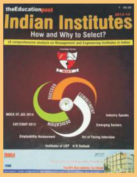
BEST MANAGEMENT INSTITUTE IN NORTH FOR PLACEMENT EFFORTS